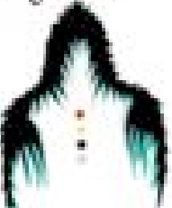
Sabe (Bigfoot) Honesty